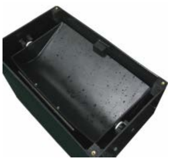
Easy and quick to service inner working mechanism