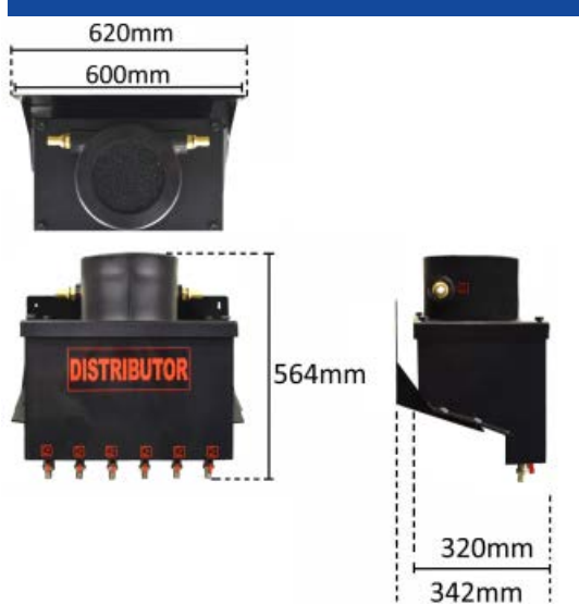
Wall mounting bracket, fixing material and spirit level included