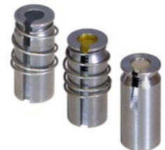
The right seal for the right job!