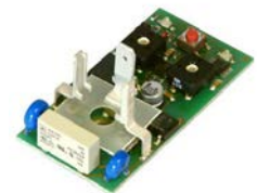
Highest quality PCB