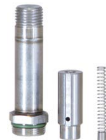
Direct acting valve assembly, offering you reliability